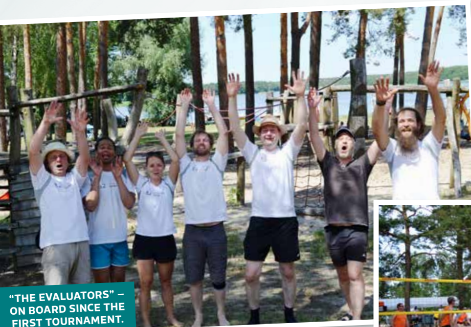
"THE EVALUATORS" – ON BOARD SINCE THE FIRST TOURNAMENT.

For the 10th time, Energiequelle invited employees to take part in a beach volleyball tournament and networking event at the company's main site in Kallinchen.