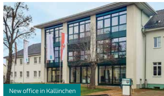
New office in Kallinchen